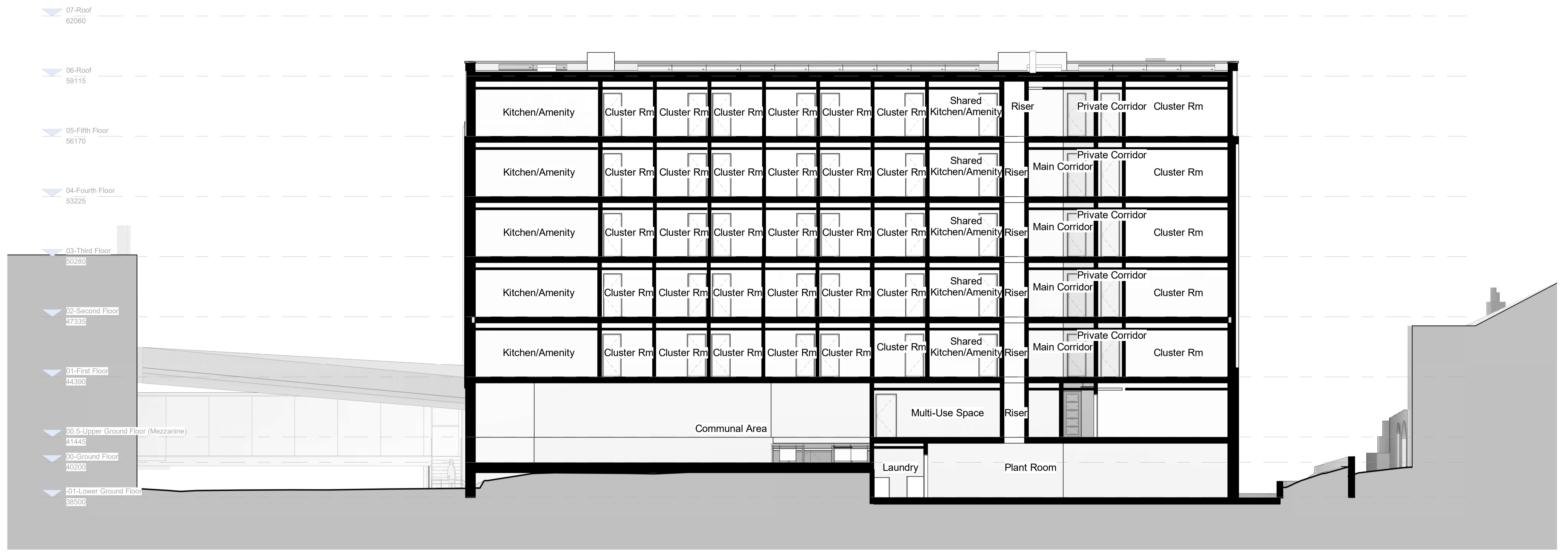
Section C-C 1 : 100